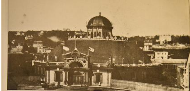
The Victoria Skating Rink on City Road. Opened in 1865, the rink was demolished in 1928. Besides ice and roller skating, it was used for concerts and exhibitions, such as the 1875 Manufacturers and Mechanics Exhibition. After the Great 1877 Saint John Fire, the rink housed hundreds of homeless people. The Colonial Inn Motel stands in its place today.